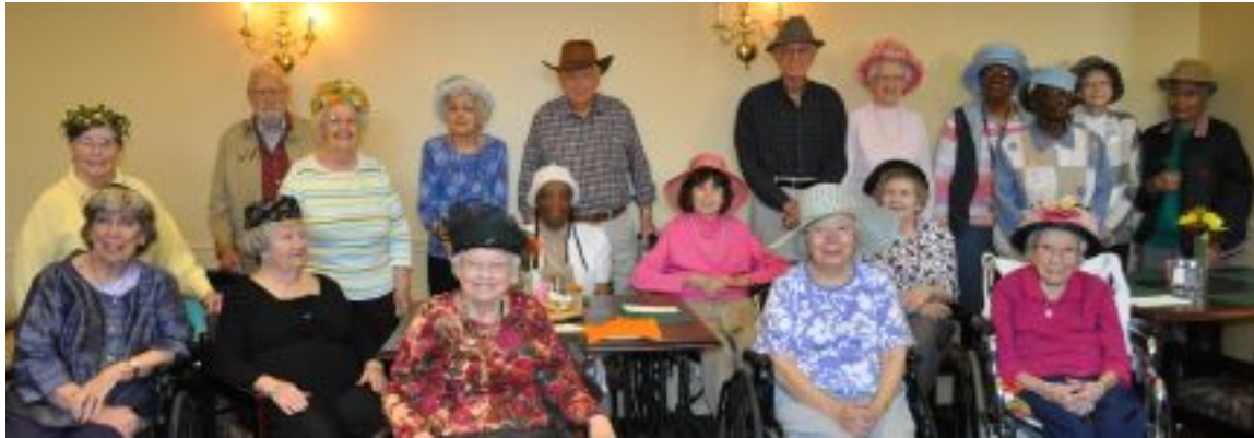
TEA AND HAT PARTY