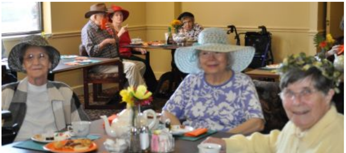
MORE FROM THE TEA AND HAT PARTY