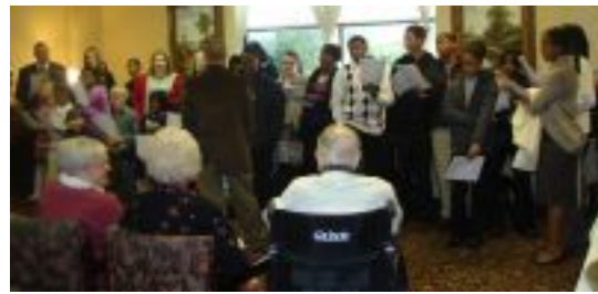
and more carolers...