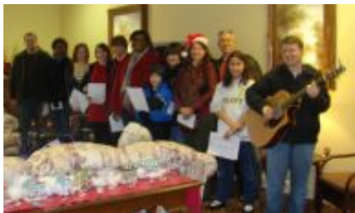
We had carolers from local churches...