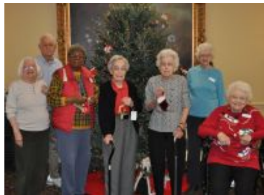
and trimmed the Christmas tree in the dining room.