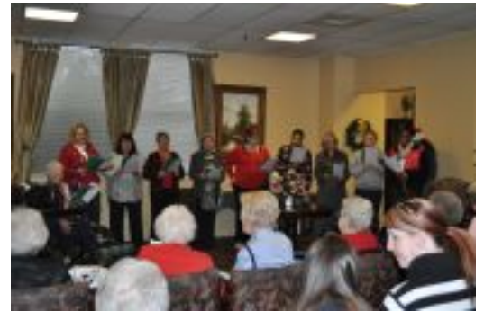
St. Mark Lutheran Church also on Dec. 11.

Thank you all for making our Christmas merry.