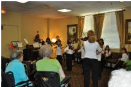
The Suzuki Young Performers