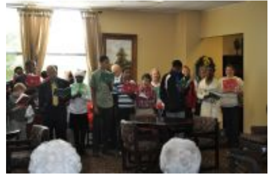
Avondale Christian Church on Dec. 11.