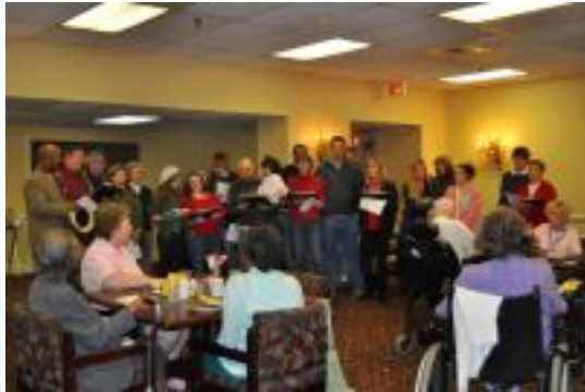
United Methodist Church on Dec. 4.

We are blessed with so many groups coming to sing carols for us.