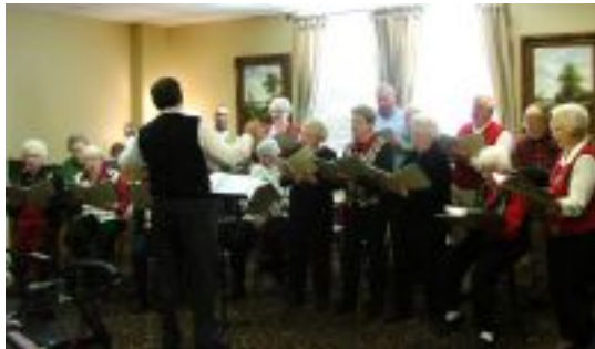
Briarlake Church Singers on Dec. 5.