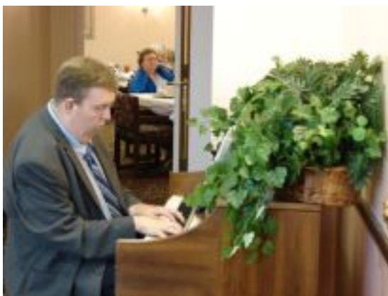
AND WE EVEN HAD ENTERTAINMENT