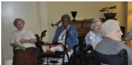
More Happy Hour