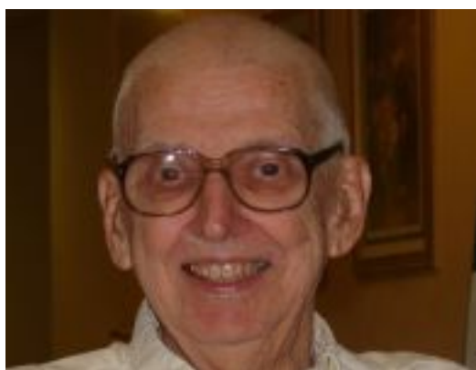
by John Beavers

So before we can wrap up The World Series and all, There comes the painful truth: Ya gotta hit th' ball!