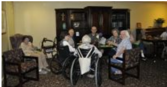
The April 28 Wine and Cheese Happy Hour