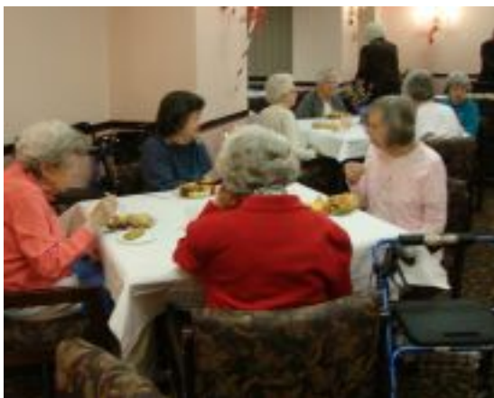
Lots of ladies celebrating