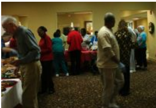
A really long buffet—lots of food.