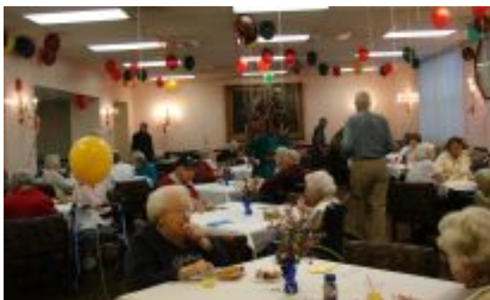
And gentlemen, too