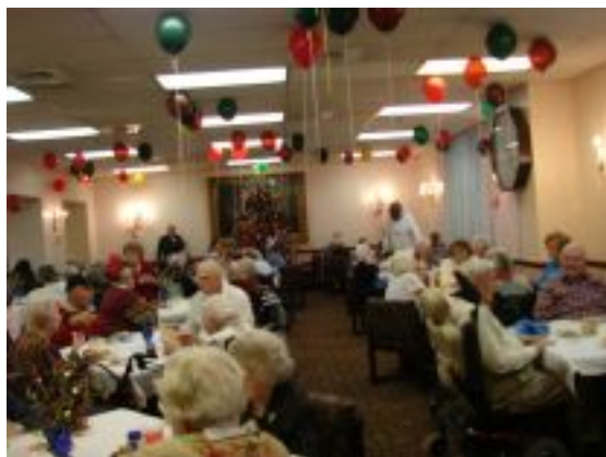
There was a crowd at the New Year's Eve party.