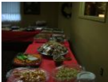
THE FOOD AND DRINK TABLES WERE BEAUTIFUL AT OUR NEW YEAR'S EVE PARTY.