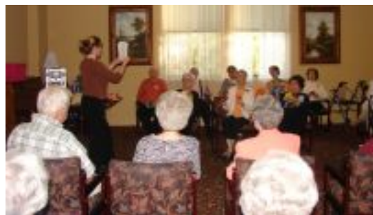
The Ding-a-lings from The Regency House