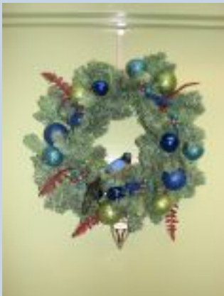
2nd BETTY YOUNG