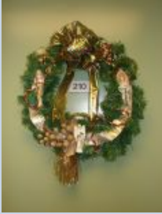
1st ELLEN WRIGHT