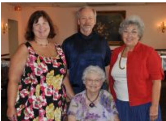
with her family