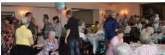
and MANY friends,