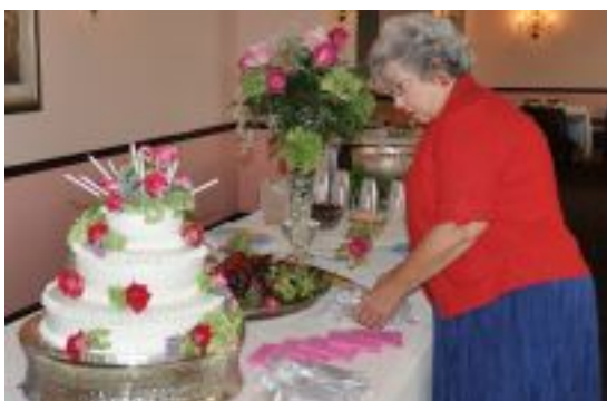
plus wonderful refreshments,

celebrated her 90th birthday party on Aug. 14 at Coventry Place. Here's to many, many more.