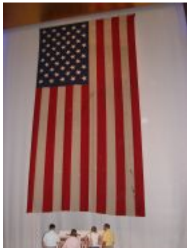
THE FLAG THAT FLEW FROM THE PENTAGON ON 9/11/01