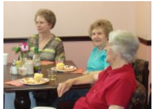
AND MORE FRIENDS