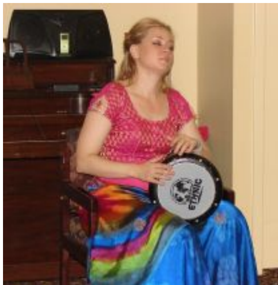
Each month we have Dance Therapy