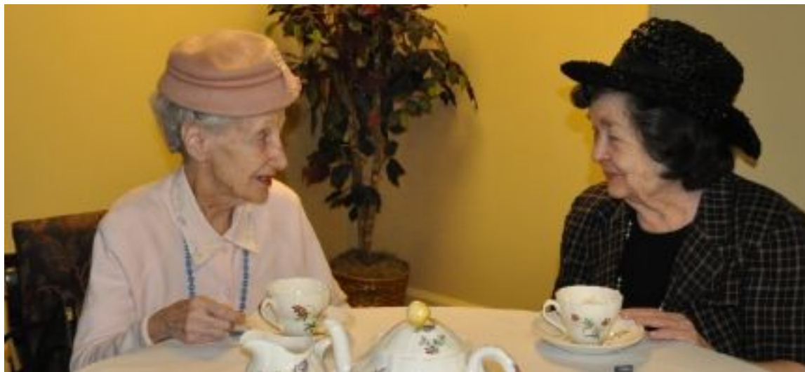
THE HAT AND TEA PARTY