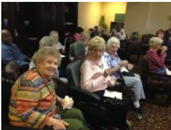
Residents enjoying the ice cream social.