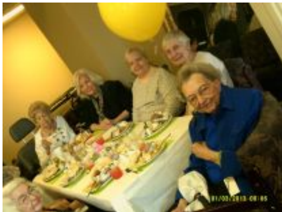
Snaps from our birthday party!