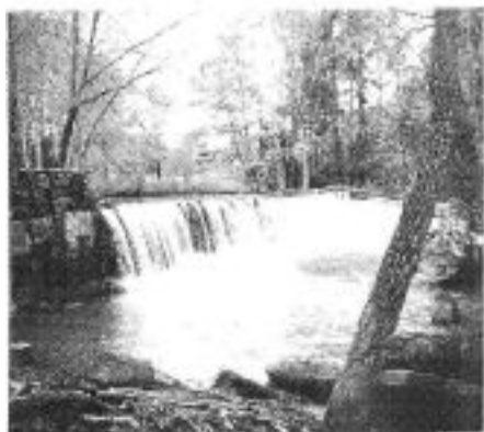
Costley Mill Park is pretty in all seasons.