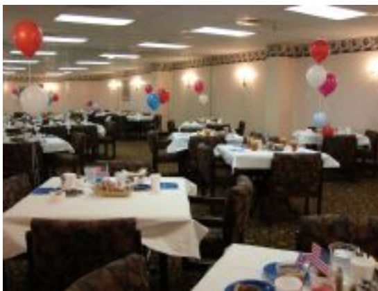
The reflections in the mirrors in the back dining room really added to the festive look.