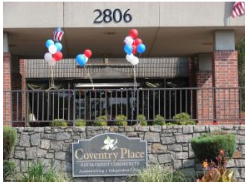
BALLOONS FLEW HERALDING JULY 4th

Our staff is dedicated to making you feel at home in your new home at Coventry Place. Our job is to make sure that your life in our community is comfortable, safe and enjoyable. We want you to be happy here and to feel you've found a place to stay, that you're part of the family. Thank you for being here.