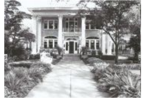
THE BLUE WILL INN

We welcome families and friends to come to "OUR HOUSE" for Christmas luncheon on Dec. 23. Guest meals are $5, payable at the front desk. Reservations need to be made.