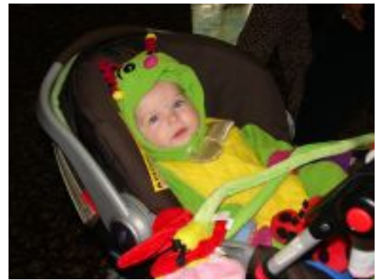
We even had Donna Brown's granddaughter all dressed up for Halloween.