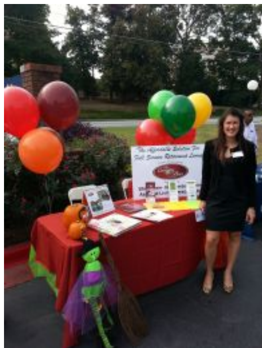
Booth staffed by our Marketing and Personal Care Directors.

On Oct. 16, Coventry Place had an honor to participate at the Health Fair sponsored by Manor Care. This was a great opportunity to educate and let visitors know about our community and what we do.