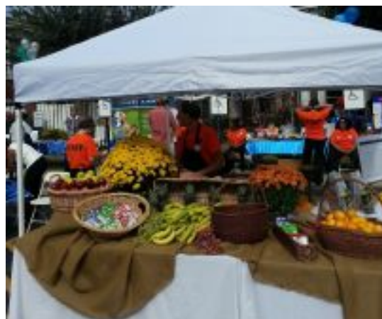
The Stand at the main entrance at Manor Care was great and full of healthy food choices.