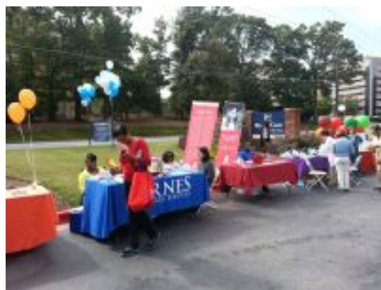
Manor Care's participating providers.