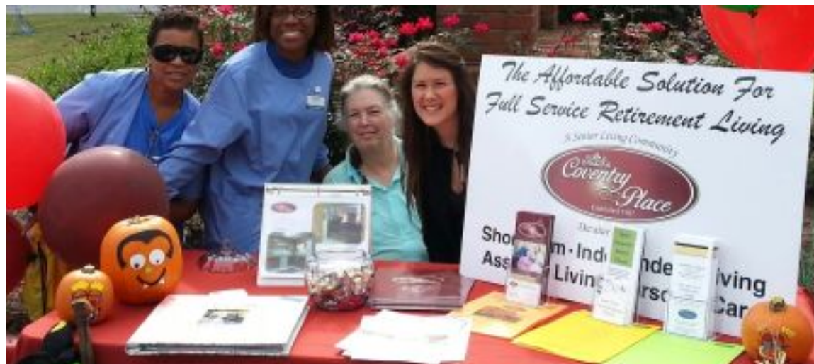
Oct. 16 Health Fair at Manor Care

It's that special time of year, and we're ready to celebrate! Join us for a fabulous holiday celebration! We'll have food, games, music and prizes to give away, as well as lots of fun with friends, neighbors and staff. Happy holidays, and we hope to see everyone at the festivities! Check with the office for details.