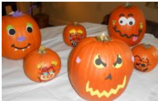
Residents' Arts and Crafts Project