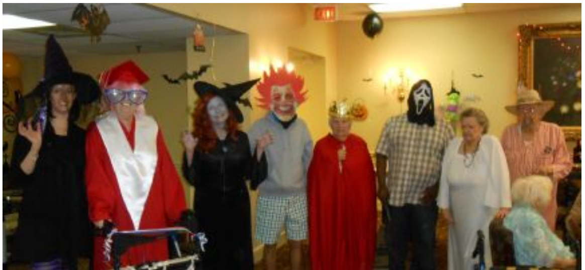
Great costume ideas made by our residents. The Halloween party was a great success.