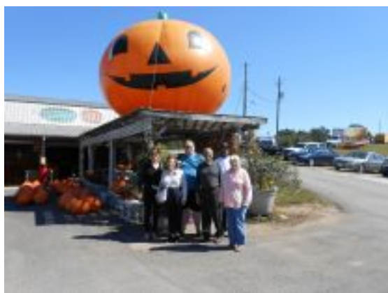
Jaemor Farm Outing