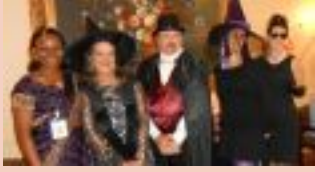
Coventry Place staff dressed up.