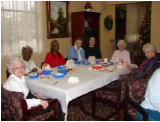
AT THE DECEMBER ARTS AND CRAFTS, THEY MADE BEAUTIFUL GINGERBREAD HOUSES.

The bus was full for the trip to Lake Lanier to see the Christmas lights.