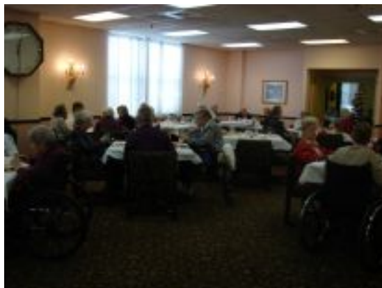
And lots of residents and guests!