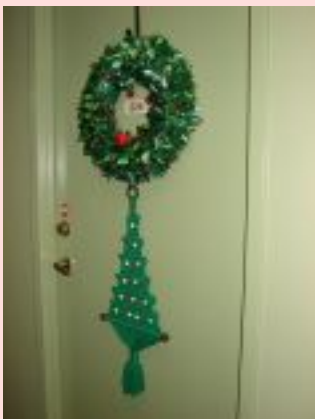
3rd PLACE - JACKIE MERAN