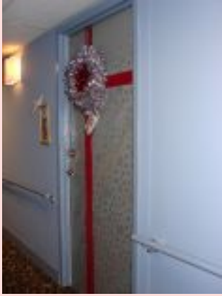
1st PLACE - BOBBIE IDLEMAN