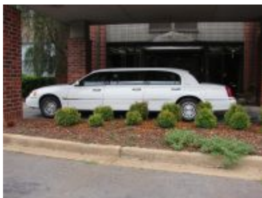
OUR NEW TRANSPORTATION

It was time for new transportation for our residents when we take them to their appointments. As I was discussing this with the managing partner, I said I really wanted something that was not as high as a van because it is hard for some of our residents to climb up versus just sitting down in a regular car. Well, one thing led to another in that discussion, and look what we ended up with for our new vehicle?