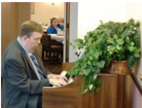
AND WE EVEN HAD ENTERTAINMENT