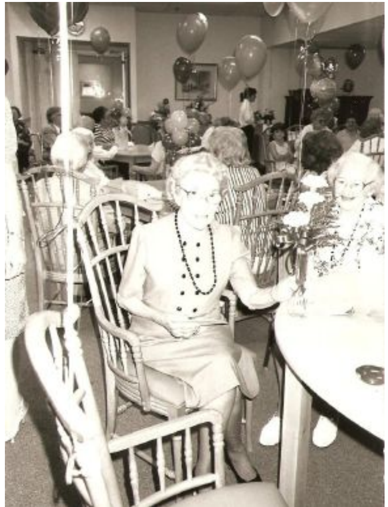
WHO IS THIS? HINT - SHE'LL BE 101 ON JULY 29.

Our staff is dedicated to making you feel at home in your new home at Coventry Place. Our job is to make sure that your life in our community is comfortable, safe and enjoyable. We want you to be happy here and to feel you've found a place to stay, that you're part of the family. Thank you for being here.