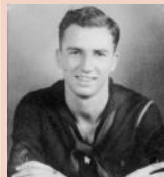
WHO IS IT #4?