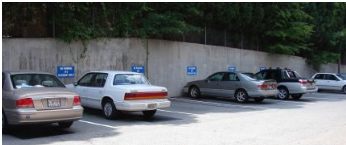
WE'VE MADE PROGRESS ON OUR PARKING LOT!