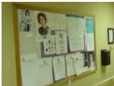
The bulletin board is located in the hall across from the post office boxes.