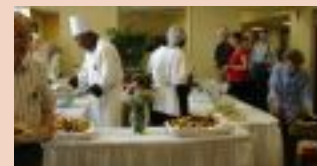
THE BUFFET SERVICE