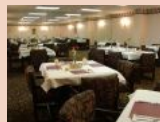
THE BACK DINING ROOM