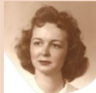
WHO IS IT #1?

We need help from the families and friends of our residents for the sixteen residents who still own and drive their cars but have difficulty walking long distances. We have assigned parking spaces to those who have handicap permits. Those residents met with me and worked out on their own which resident would have which parking space. When it says H2 , that refers to a certain resident. FAMILIES AND FRIENDS , don't park in those spots. We will be re-lining in the lower level parking lot, also where you can use the back elevator.