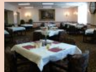
FLOWERS FOR THE TABLES