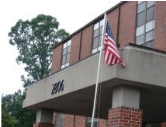
AS THE FLAG FLIES OVER 2806 ON JULY 4, WE'LL CELEBRATE.