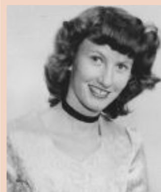
WHO IS IT #3?