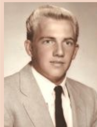
WHO IS IT #2?