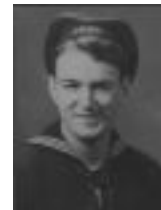
WHO IS IT #5?