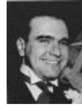
WHO IS IT #1?

This month the prize(s) will go to the person(s) who get the most right. There will be copies of the article at the counter for you to fill out and put in the box.