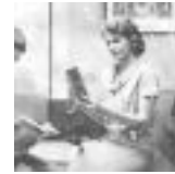
WHO IS IT #3?