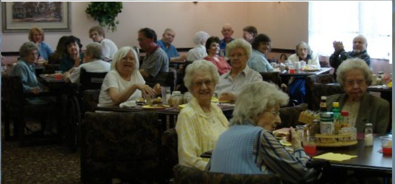
SMILING FACES AT THE WINE AND CHEESE PARTY ON THE 12th